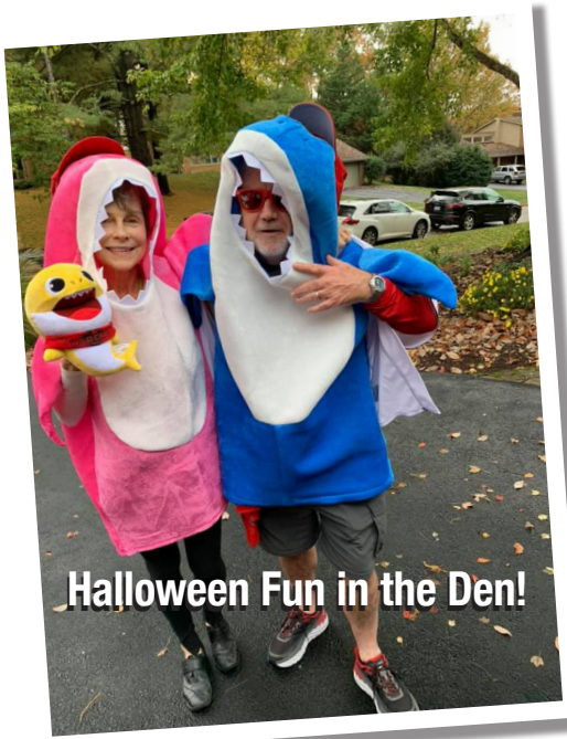
Halloween Fun in the Den!